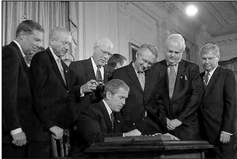
October 26, 2001

27 The Patriot Act was a direct response to